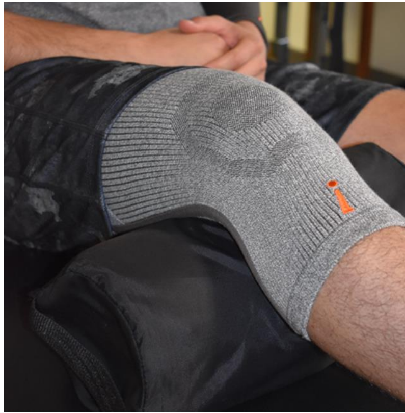
Figure 3. Soft Knee Brace—Incrediwear. Representative image of patient.