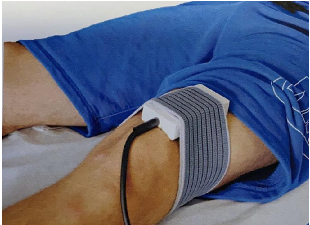
Figure 1. LIMFA application. Representative image of LIMFA application during treatment of knee osteoarthritis.

Patients participated in ten ( n = 10 ) sessions of antiphlogistic and antiedema programs (first cycle) (15 min each) for 2 weeks, 5 days/week, followed by, without interruption, twelve ( n = 12 ) sessions (20 min each) of bone repair and connective tissue repair programs (second cycle) for 4 weeks, 3 days/week (Figures 1 and 2).